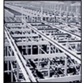
Cooling Tower Structure